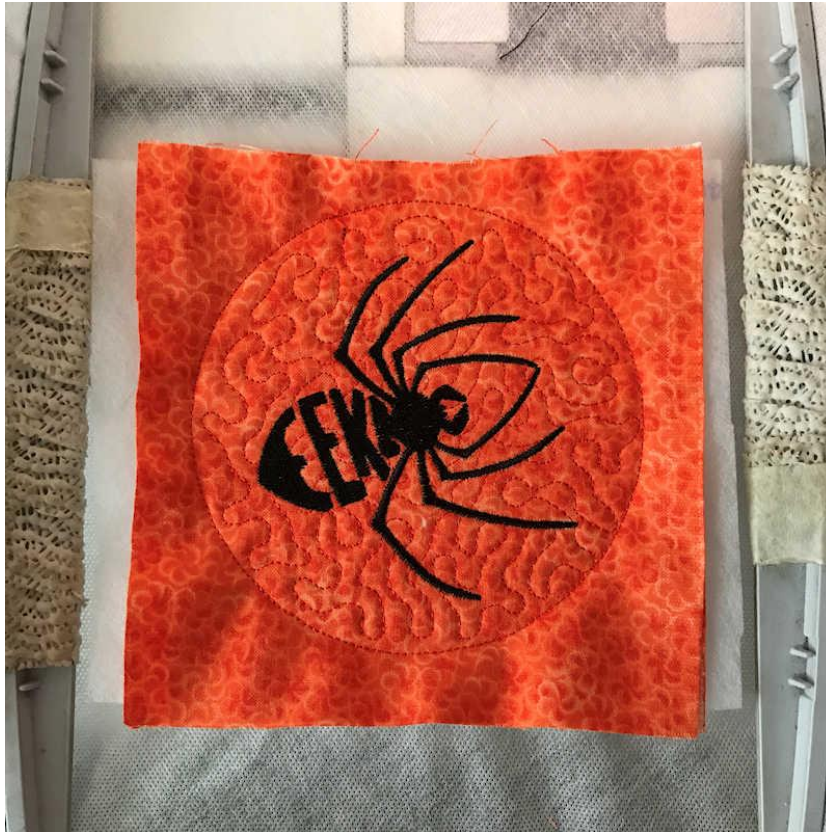
Stitch Color 4 - Design