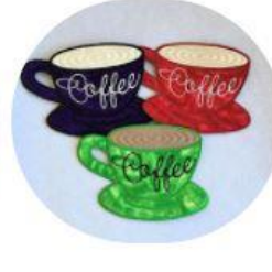
Designs made with Freebies